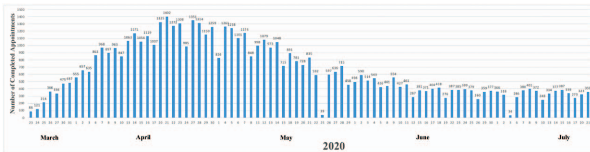
Figure 2. Completed appointments with ambulatory telehealth at our healthcare system in response to coronavirus disease 2019.

recovery, defined as resolution of fever without the use of fever-reducing medication, improvement in respiratory symptoms, and at least 10 days had passed since symptoms first appeared. [16] Of the total 1818 employees who had been furloughed but did not necessarily have COVID-19, 1707 (94%) have already returned to work as of July 21, 2020.